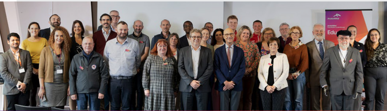
The winners of the 2024 Minigrants and the governors of the ArcelorMittal Foundation

Each year, the Foundation supports several projects that concerns at least one of its four pillars: Social, Education, Environment, Culture and Heritage.