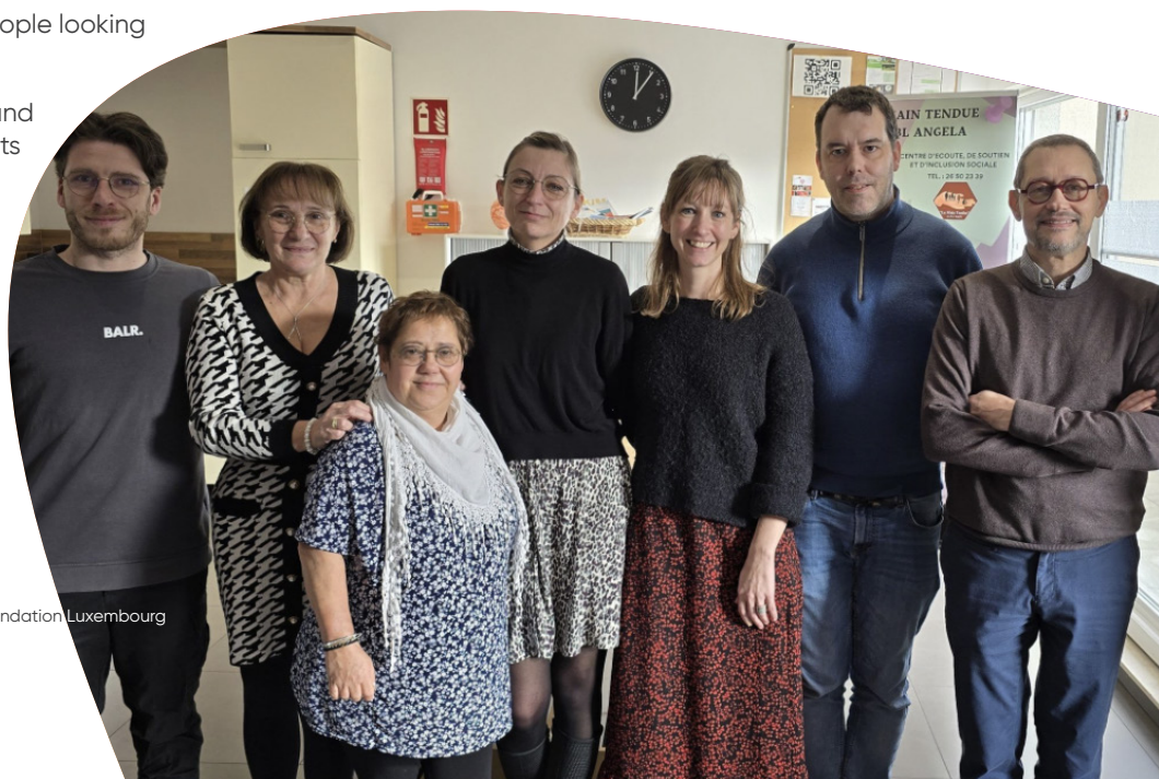
La Main Tendue team with the Foundation representative