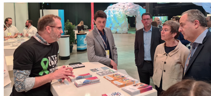
Visit to our stand from the Minister for Health and Social Security