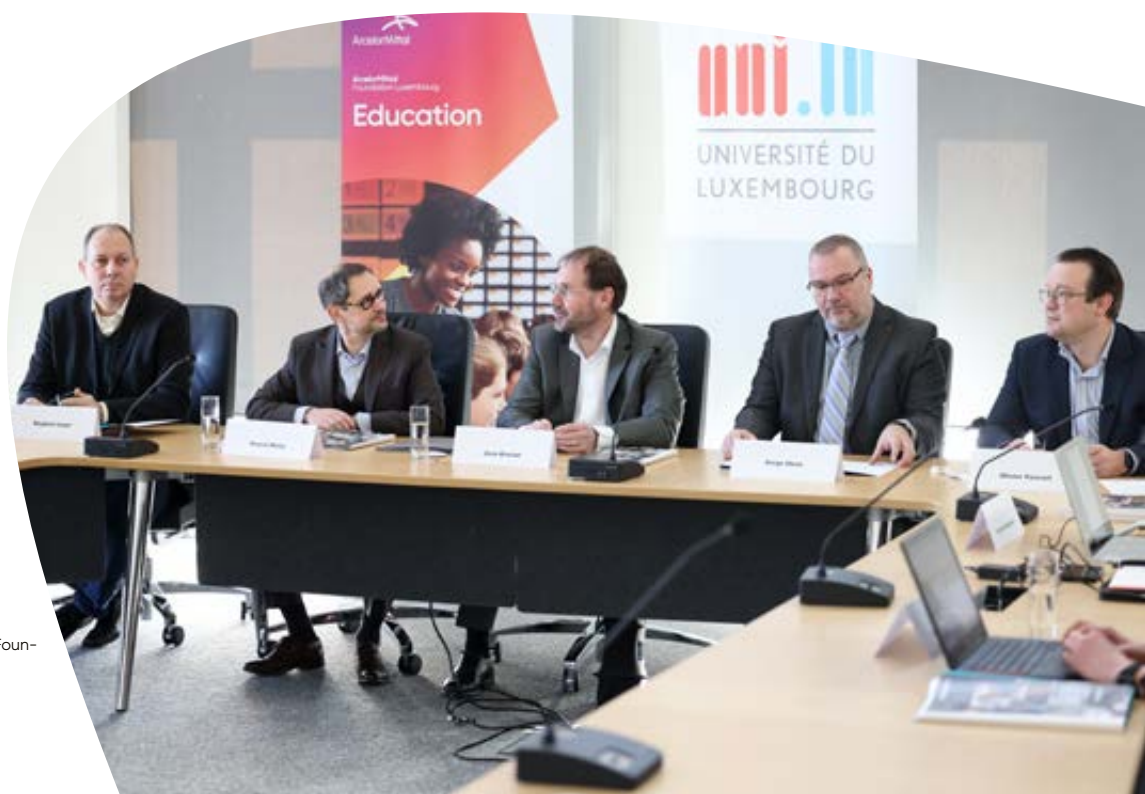
Renewal of the partnership between the University of Luxembourg and the ArcelorMittal Foundation, 13 February 2023